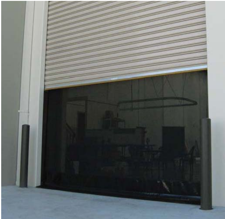
Extendador Security...the ideal solution to natural factory ventilation & lighting

Covertex Extendador Roller Door Screens have been designed to prevent the entry of unauthorised personnel, dust, debris, bugs & birds while maintaining ventilation & external viewing for the factory environment